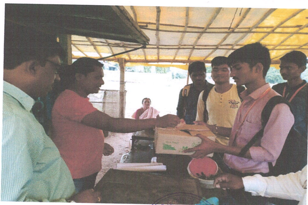
Students collecting funds from community