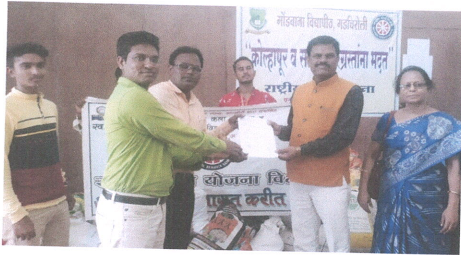
Handing over cheque to Gondwana University authority